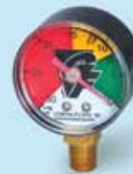
FRI (K) 30" Vacuum Filter Restriction Indicator Gauge