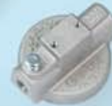
11V (1A) Alum Residential Filter Head w/Port