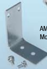
AMB (B) Angle Filter Mounting Bracket